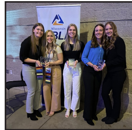
Award winners. These competitors won awards and are going to nationals.

On April 7-9, the students who qualified for state went down to Madison to compete in their divisions. The following students