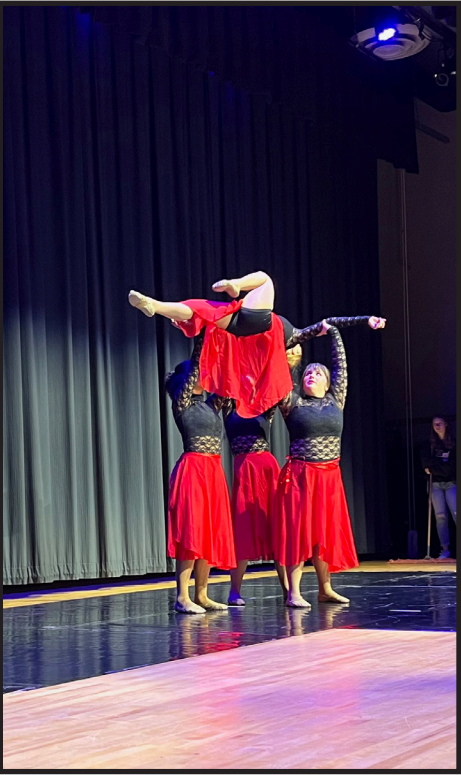
Group effort. Cameron High School dancers perform a small group routine.

High school dance is often seen at various sport events performing routines. However, on April 6th, the Cameron High School Dance Team was able to perform at a recital. The dance recital will hope-