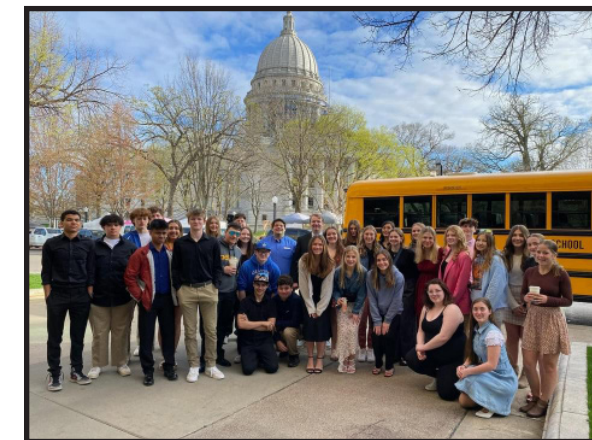
Today's the Day. The forensic competitors are ready for their final hoorah down in Madison.

score you can get is 25. Which is why we wanted 25's, or as we say, going for gold. If you were to score a 24 or 23 you received a silver, and a 22 or 21 you would receive a bronze. These