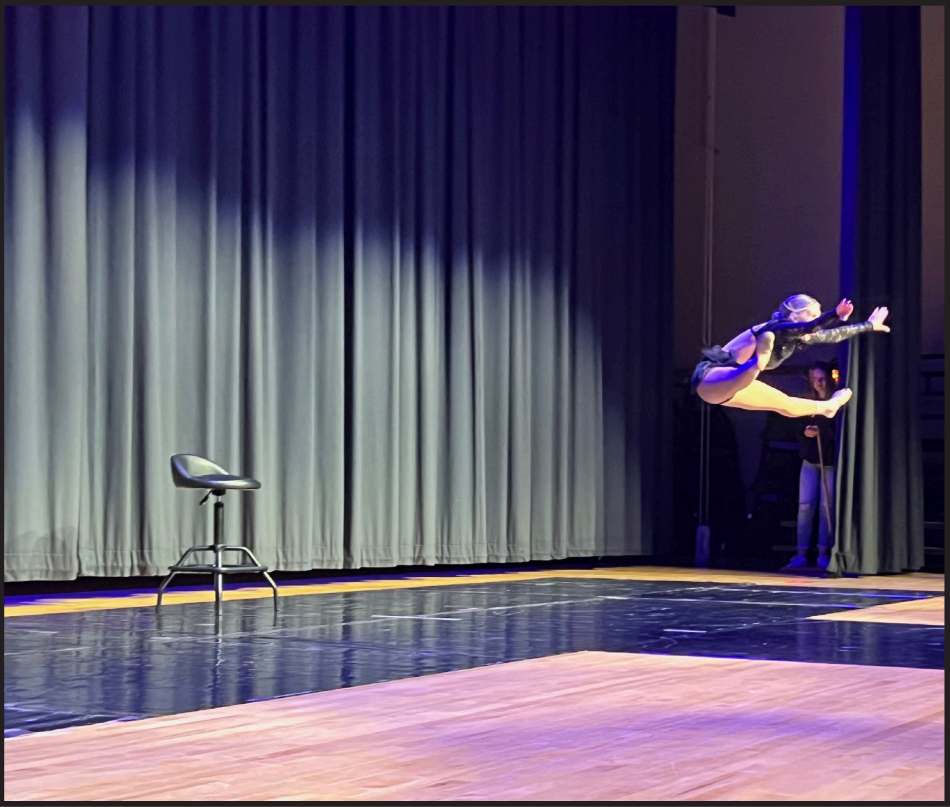
Jumping for joy. A Cameron High School dancer performs an astounding leap in her solo routine.

fully become an annual tradition. The high school dancers performed their competition routines. Dancers were also able to cho-