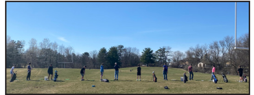
Chipping away. The golf team takes advantage of the good weather and goes outside on the practice football field behind the school.

One of the biggest struggles that the golf team has faced this year is the weather. With all cold temperatures and bad weather this spring, the golf team hasn't