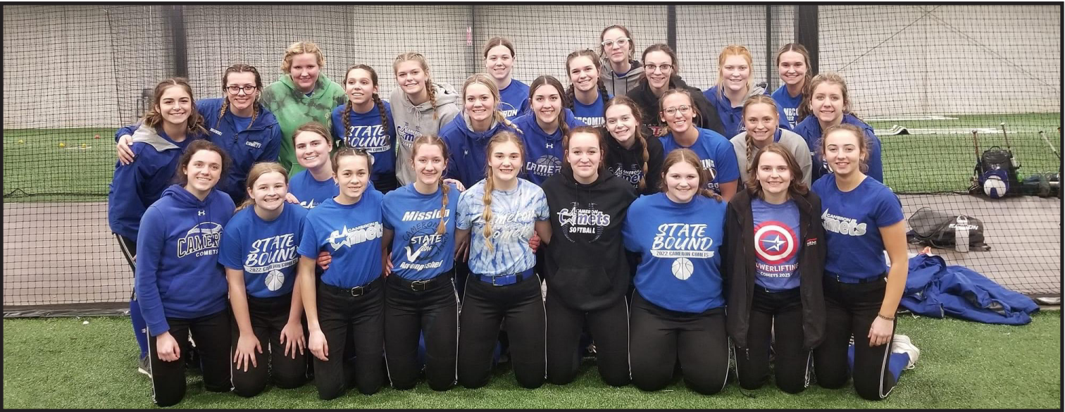
Working as a team. The Cameron High School softball team gathers around after playing a game indoors.

the team, but they've been persevering despite the busy schedule. The team works well together no matter how rough an inning might get. The seniors are part of this teamwork and they will enjoy their last moments. However many tough things may be thrown at the team, they're sure to hit it out of the park.