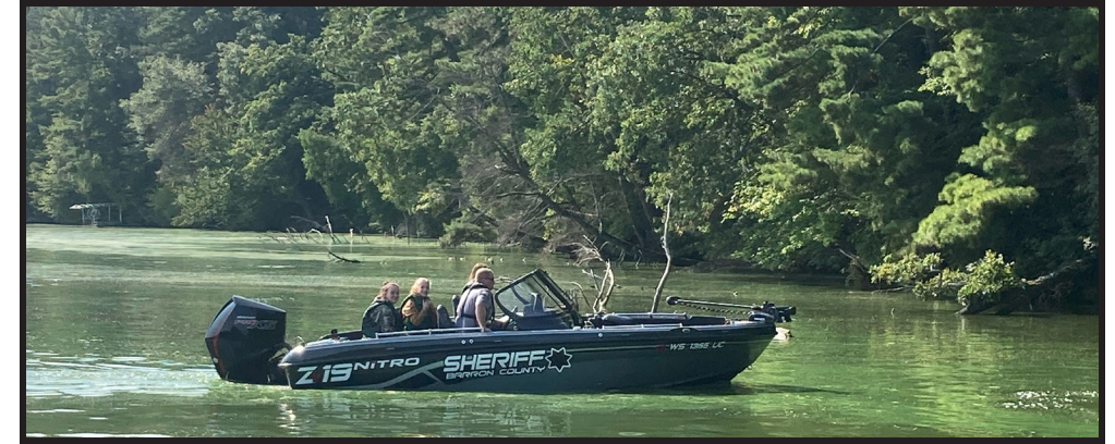
Patrolling police. Cameron High School students ride on a police boat with the local police officers.

Canoeing was just one part of the trip. DNR boats, a Sheriff's boat, and a pontoon were also present during the trip. Students rotated between the boats and