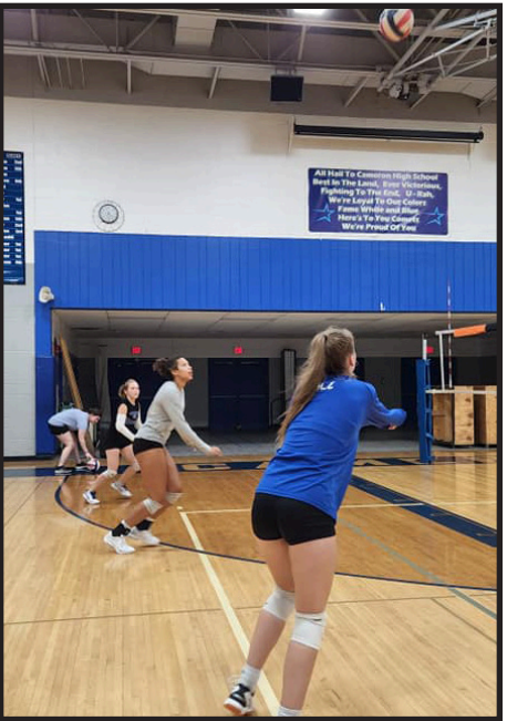
Practice makes perfect. The junior varsity and varsity volleyball teams practice after school for upcoming games.

Despite the injuries, the team is doing well during their tough schedule playing D1 and D2 teams. This season has differences from past seasons; the biggest one being that the teams switch sides again, as they hadn’t for the past