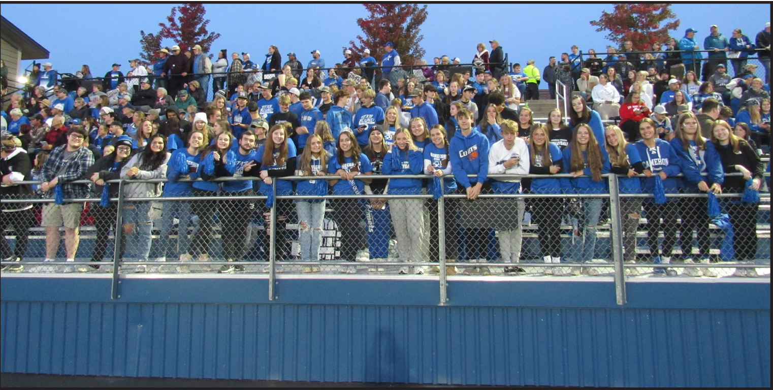
Packed stands. The homecoming game was packed with fans at Cameron’s home field on Friday, September 30. The Comets beat Spooner 36-34.