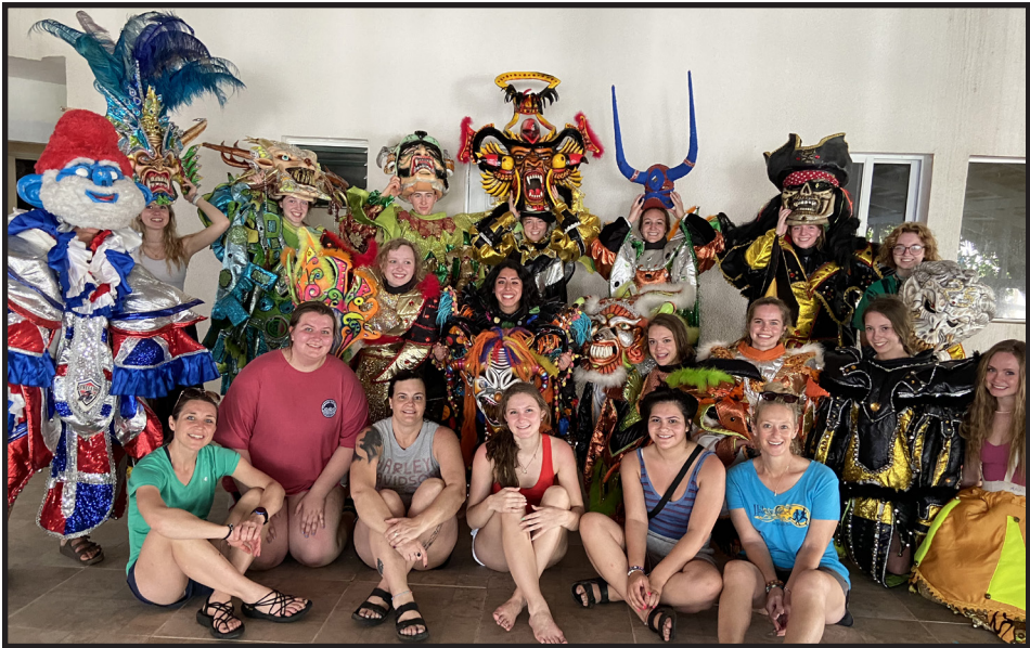
Colorful costumes. The Dominican Republic group dressed in vibrant costumes and learned to dance.

and they will also be going to Arenal Volcano National Park. White water rafting, ziplining, a river kayaking tour, and horseback riding are also on the itinerary, and, of course, a beach day. They will be led by a tour guide while they are in Costa Rica who is a native speaker and they will also