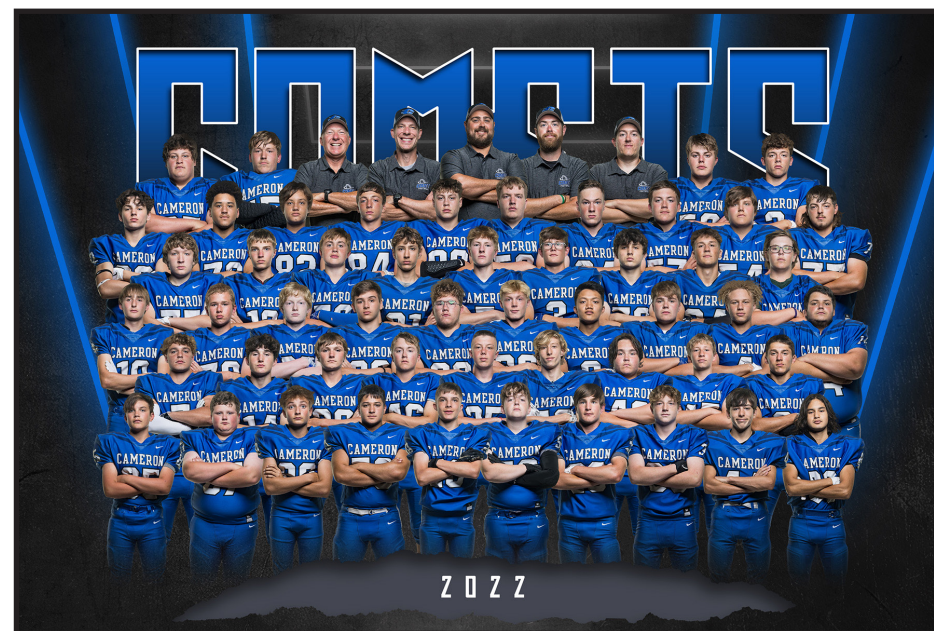
Tough team. The 2022 Comet football team broke the glass this year and made it to the play-offs.

Congrats, Comets! The glass is broken and the sky is the limit!