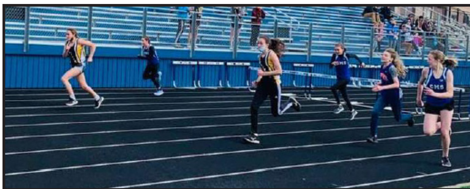
Run, runners, run! Cameron School runners make a dash for it hoping to win the event.