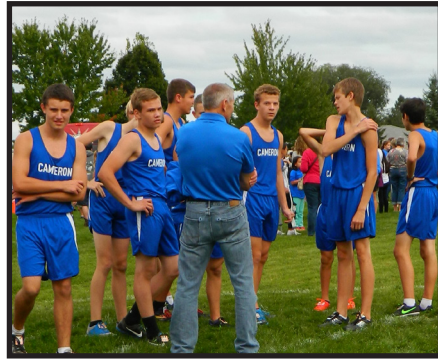
Get ready. The boys warm up before the Chetek meet.

"I think we improved tremendously. We are taking at