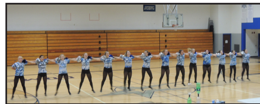
Kicking it at homecoming. The Cameron Dance Team performs during the homecoming pep rally to AC/DC's You Shook Me All Night Long which they performed again during halftime at the football game later that night.

When these new coaches stepped up, the entire team took a big leap of faith and never looked back. A new year brings new coaches, new dancers, and new chances. This team is ready to step it up and make it to the top.