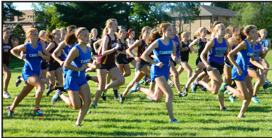
And they're off! The girls take off at the start of the race at the Cameron home meet.