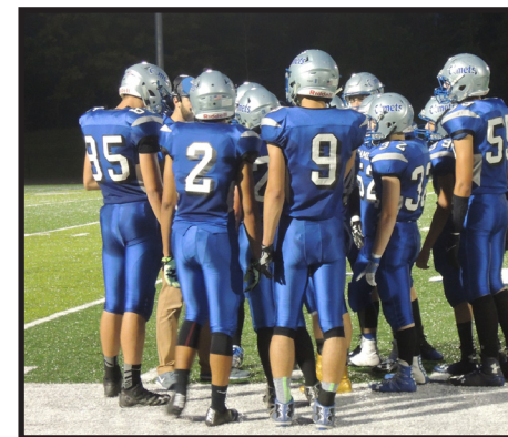
Huddle. The Cameron football huddles during a time out to get the team pumped up!