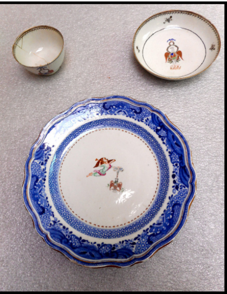
Fine dining. George Washington ate on fine china.

2011 to help out with her triplet grandchildren. “In order to keep in contact with both colleagues and students at Cameron, I began subbing in the district,” she states. “This fall, I transitioned from my role as a substitute teacher into a position as an