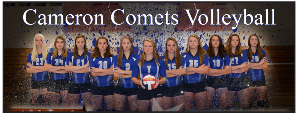
Comet volleyball. The Comet varsity volleyball team is killing it on and off the court.

These girls aren’t only passing, setting and killing on the court. They’re trying to pass, set, and kill cancer, as well.