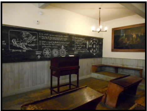
Colonial learning. Children learned in this classroom many years ago.

Mrs. Pica is a great example of how teachers continue learning to strengthen their teaching abilities. Not only is she a great teacher, but a good student, too!