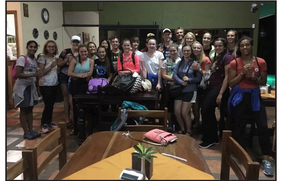
Say cheese! The group of students that went on the Costa Rica trip gather together before they leave.

They learned many new things while in Costa Rica. "While we were on the trip, we saw a lot of different things that weren't native to America. We stopped at a fruit market and tried chirimoya (a weird pear), we saw tons on crocodiles, and one of our hotels was in the rainforest. We got to see armadillos, howler monkeys, exotic birds and even saw cockroaches