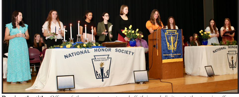
Passing the title. Officers of the current season passed off their symbolic items to the upcoming officers.

the candles -discussing the symbolism behind them. Following that, all the new members were inducted, where