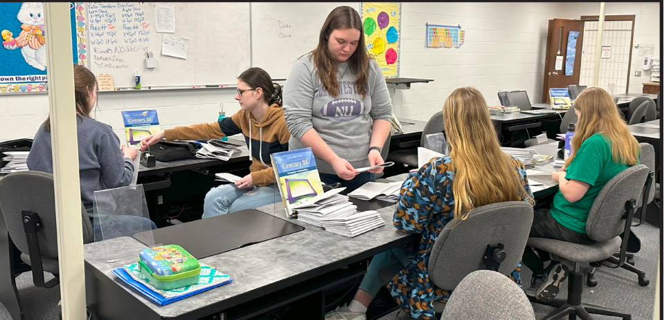
Folding, folding, folding. Our team sometimes takes two class periods preparing high school newsletters to be mailed out.