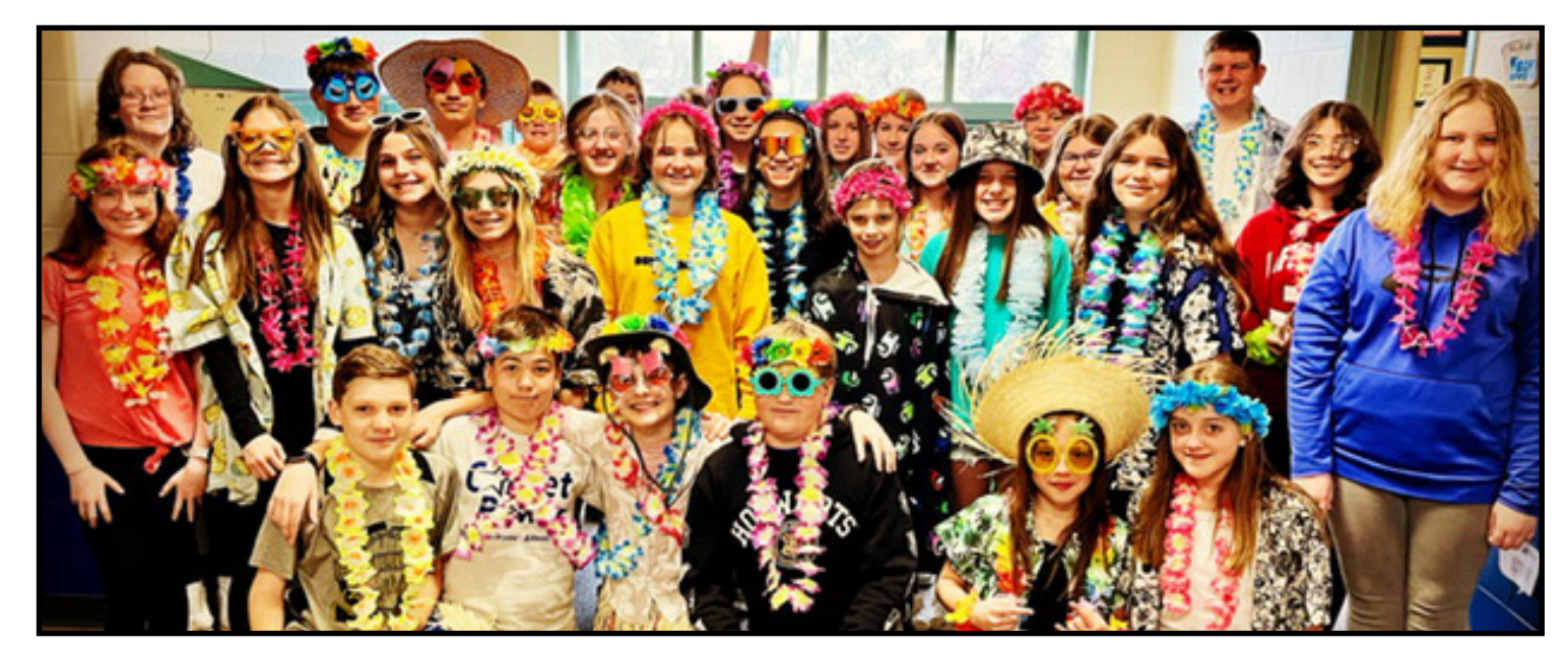
Beach day! Cameron Middle School seventh graders really dressed the part for their beach party celebration!