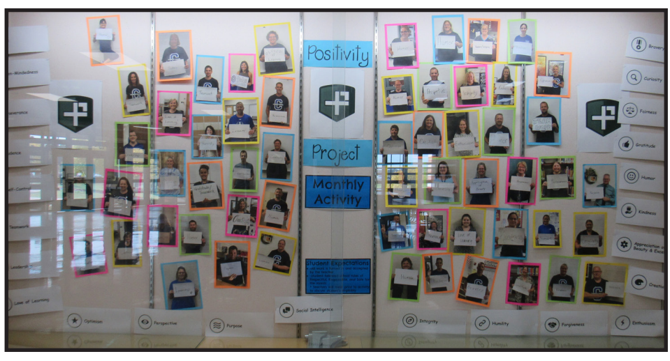
Supportive staff. The showcase, located in the middle school cafeteria, contains pictures of all the staff holding positive words, serving as a good reminder for the Positivity Project.

Through the year, be on the lookout to see the students continue to grow to be better versions of themselves as they learn about more character traits.