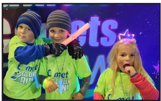
So much fun. Students enjoyed the Glow Run and the other games and activities on October 7.

These three ladies have also reorganized how the student council members work for the school. With