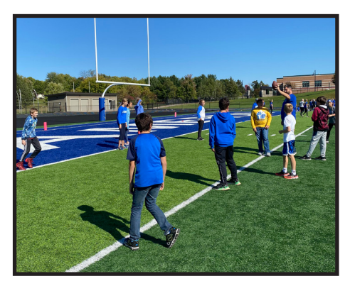
Touchdown! The middle schoolers play flag football outside on a sunny day for thier monthly P2 activity, a great way to practice having a positive mindset and positive character traits!

From the start of the school year, a target has been to have an "Other People Mindset", or OPM. To have an other people mindset means that you focus on other people and