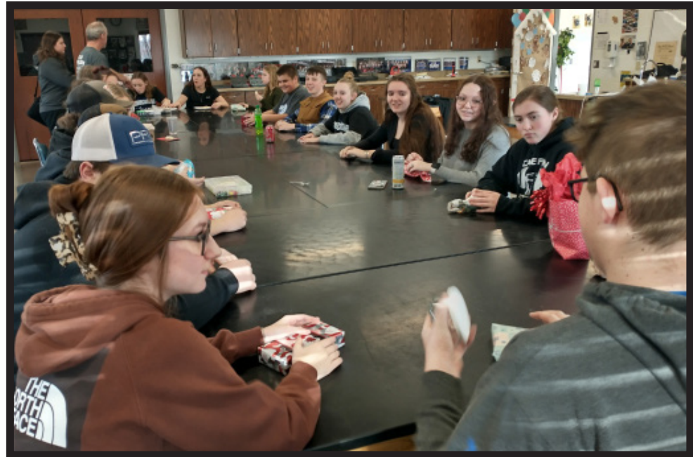
Christmas potluck! Students brought in a wide variety of meals, including: sloppy joes, pulled pork, macaroni, vegetables, meat, fruit, many desserts, and a cheese ball.

Spanish Club also traveled to the elementary school! The high schoolers shared slideshows they made about the holidays in other countries. The 3rd and 4th grade students rotated through 3-4 presentations—learning about other countries in each classroom. Some of the high schoolers provided treats and played games to go with their presentations. It was so interesting for the students to see the differences between other countries