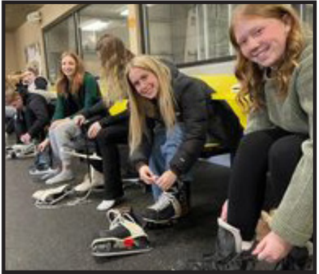
Lacing up. The high schoolers are getting their ice skates on before they start heading out to the ice rink.

vide this fun day in the coming years, we hope that students will be able to have an enjoyable time and take the given opportunity to make new memories with friends that will last a lifetime.