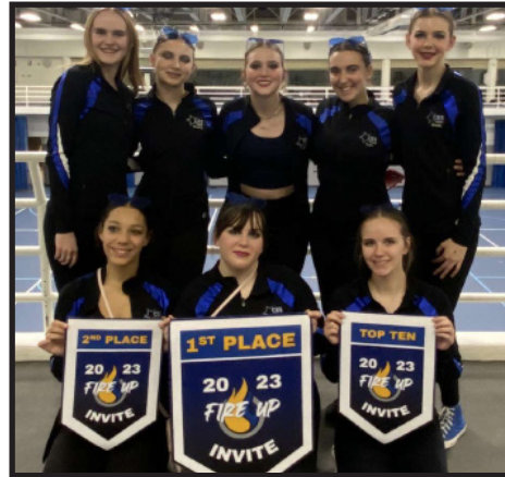
Awards. The dance team celebrates their placements at the Prairie Farm Competition.

1st in Kick and 3rd place in Hip Hop. For their last competition the team danced at WACPC where they placed 6th in Kick. Unfortunately the team missed going to state by seven points, but they had a great season at competitions and performing routines at school games.