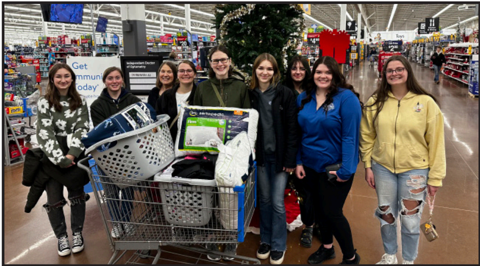
Adopt-a-Family. FCCLA bought two carts full of goodies to donate.

FCCLA did their annual “Adopt-a-Family” event. The club “adopts” a family through the Spirit of Christmas, a non-profit business dedicated to bringing holiday joy to local families in need. The