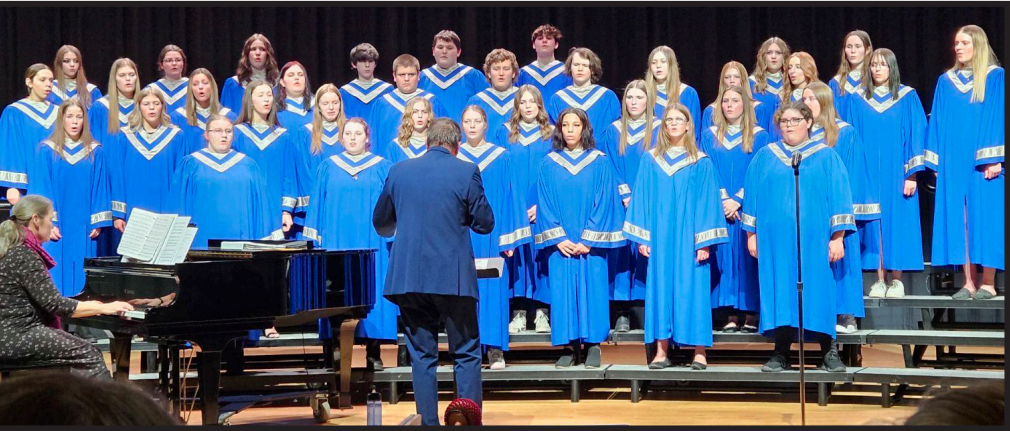
Work those vocals! Cameron High School's Choir has worked tirelessly to make sure their voices are performance ready.