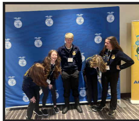
Goofing Off. The group can't stand still and keep laughing while taking pictures.