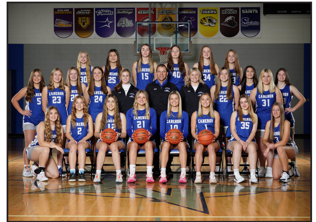
2023-24 Girls Basketball Team. This year's girls basketball team ended the season with a record of 20-6 and made it to the regional final playoff game. They finished tied for second place in the Heart of the North Conference.