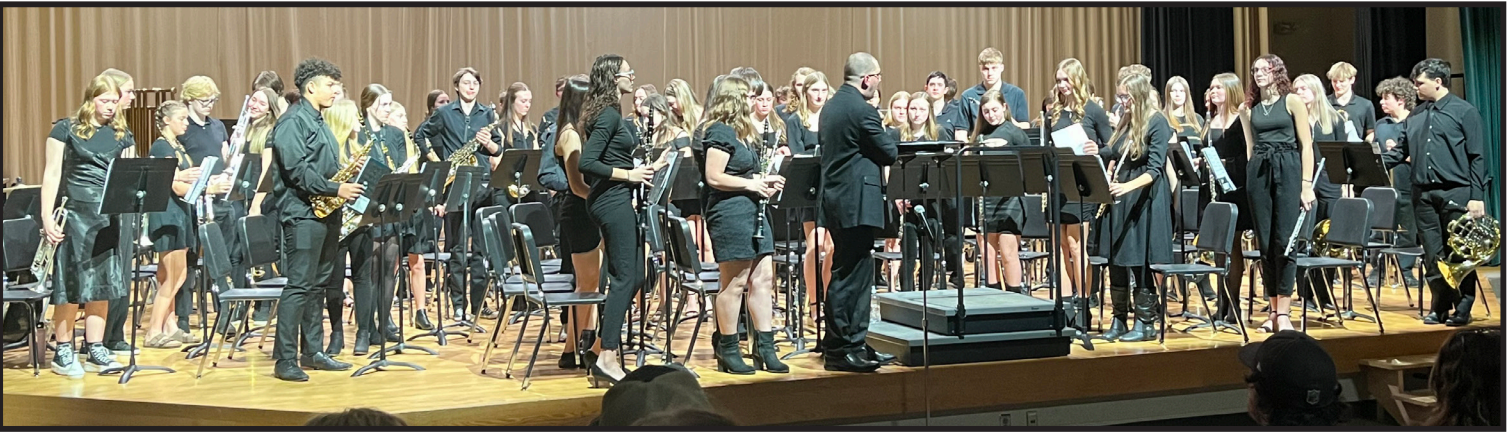
Suite for the Heroes Among Us. The high school band played a series of three songs, each dedicated to a different type of service in our community.

Special thank you to all of our community members who help keep Cameron safe, healthy, and happy!