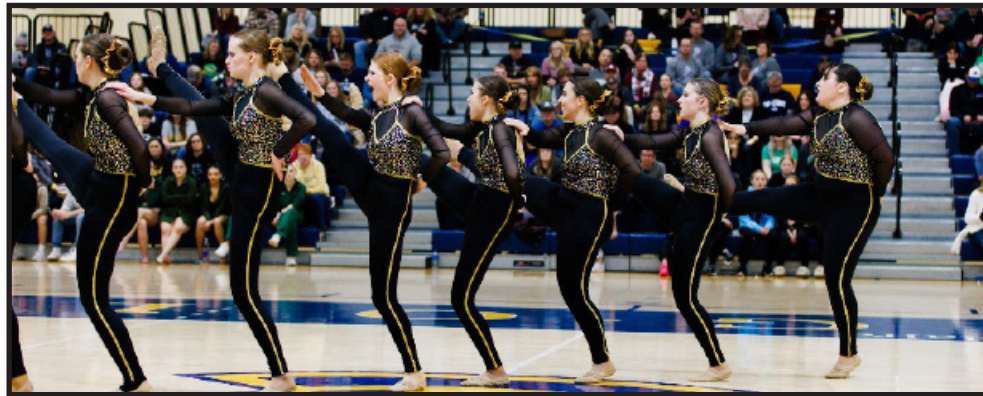
Kick line. The Cameron Dance Team performed their kick line routine at the UW-Eau Claire competition.