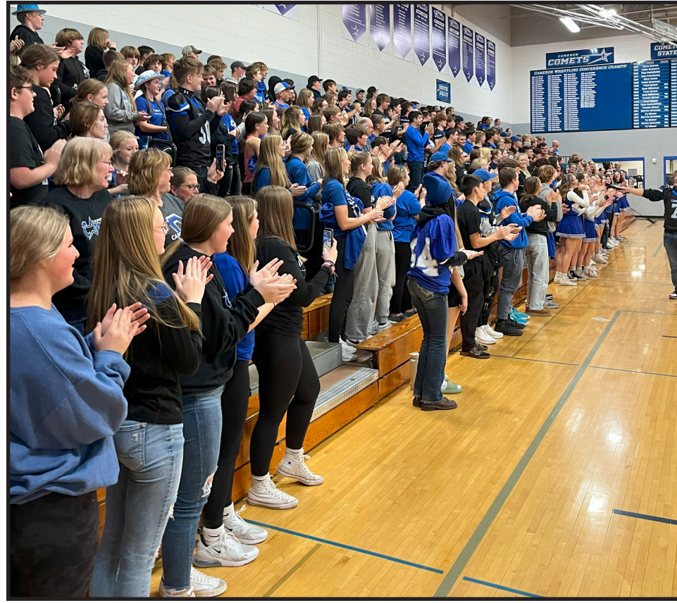
School spirit! Students wore their finest Comet gear to show their school spirit on the Friday of the Homecoming game.

One of the most eventful weeks of the year has flown by! Cameron High School's Homecoming was action-packed to the brim with activities and energy all around.