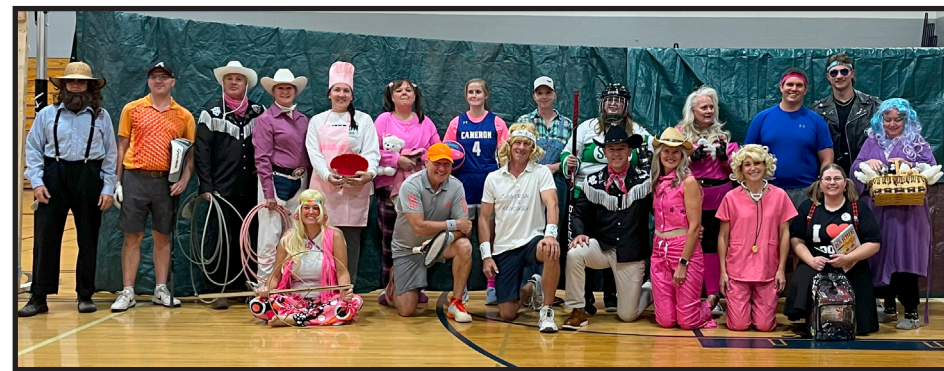
Barbies and Kens. Cameron High School staff put on a fantastic show for the student body.