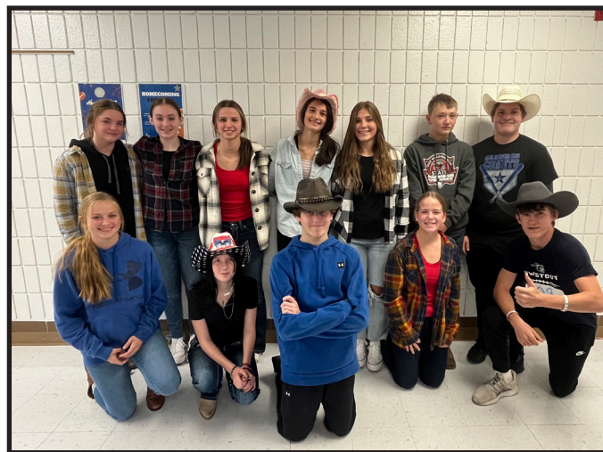
Yee-haw! Freshmen dressed in their finest country clothes to correlated with the "Ranch Dressing" theme.

On Friday, everyone wore Cameron Comet gear to show their school spirit! In support of the football team some students wore their homecoming t-shirts from FBLA. The pep assembly was held at the end of the day where three games were played: Partner Obstacle Course, Hungry Hungry Hippos, and Musical Chairs. Later on, teachers strutted their stuff at