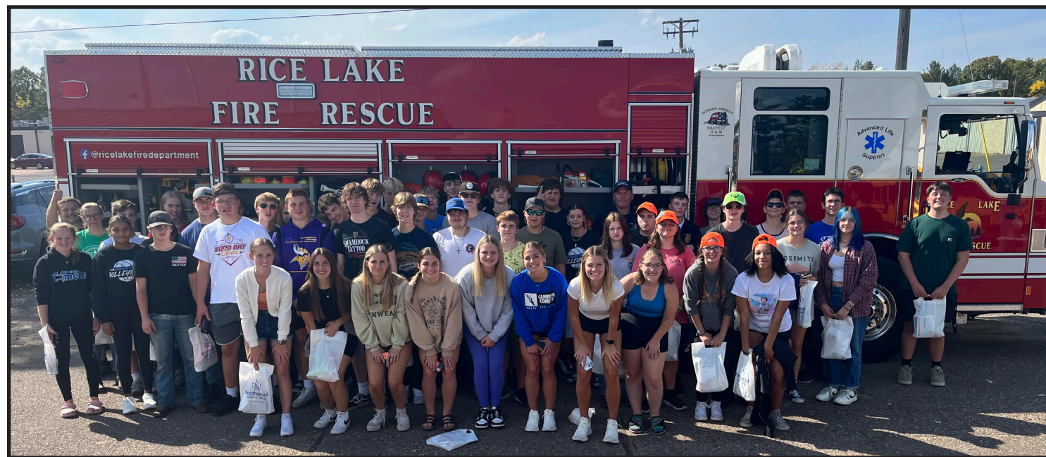
Prepared for the future. The junior class is ready for their future career paths after visiting the Barron County Career Fair.

Thanks to the Barron County Career Fair, students are given the opportunity to see what options they have as they think about their future.